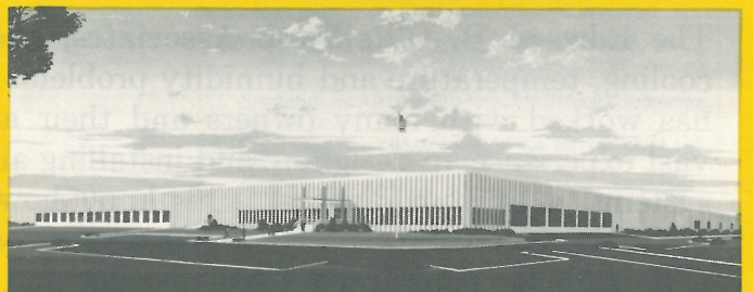
GIMBELS DISTRIBUTING CENTER