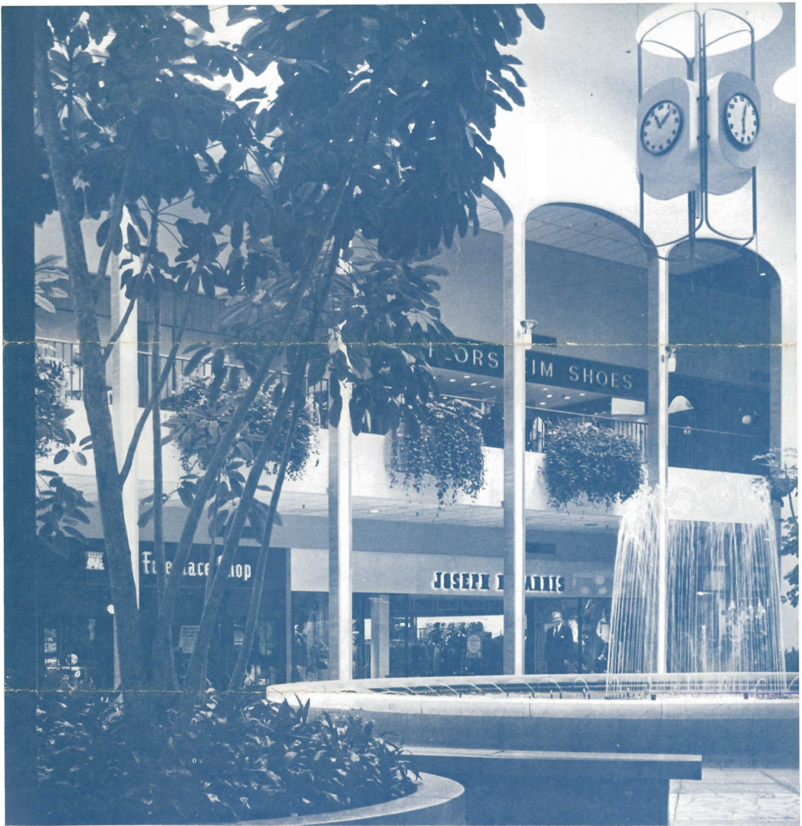
Plymouth Meeting Mall, Plymouth Meeting, Pa.